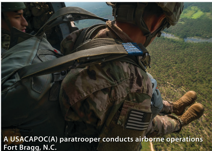
A USACAPOC(A) paratrooper conducts airborne operations Fort Bragg, N.C.