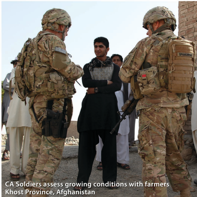
CA Soldiers assess growing conditions with farmers Khost Province, Afghanistan