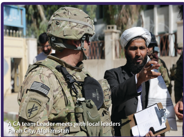
A CA team leader meets with local leaders Farah City, Afghanistan

* 85% of Army Civil Affairs forces and 83% of the Army Psychological Operations Forces are in USACAPOC(A)